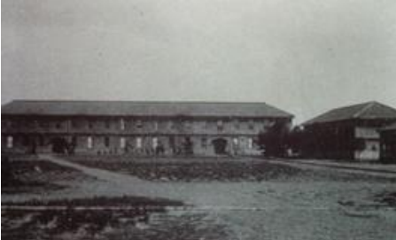
聯隊本部 Regiment headquarters