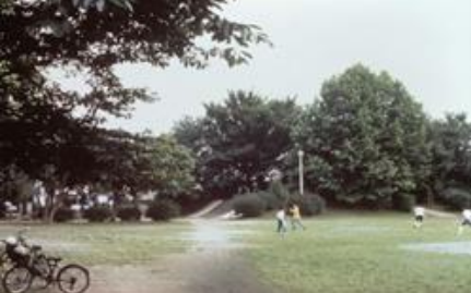
椿森公園(将校集会所跡) Tsubakimori Park (site of the officers' mess-room)