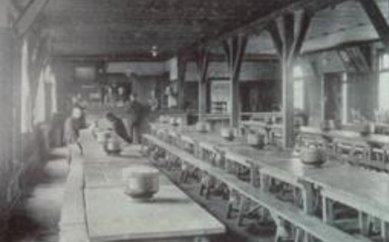
酒保(売店・食堂) Canteen (served as a cafeteria and sold other items)