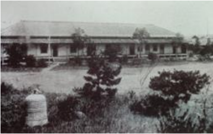
将校集会所 Officers' mess-room