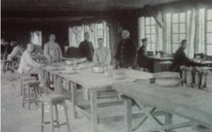
被服工場縫工場 Garment factory