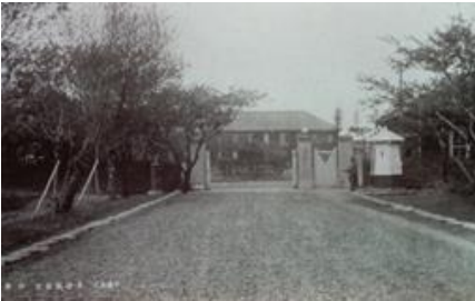
正門 main gate