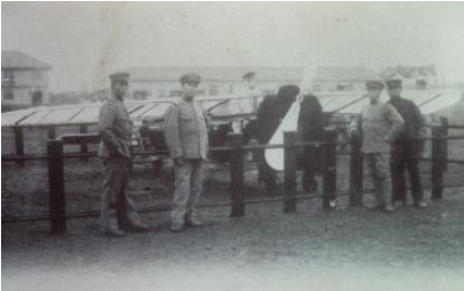
材料廠式装甲飛行機 Armoured material storage airplane