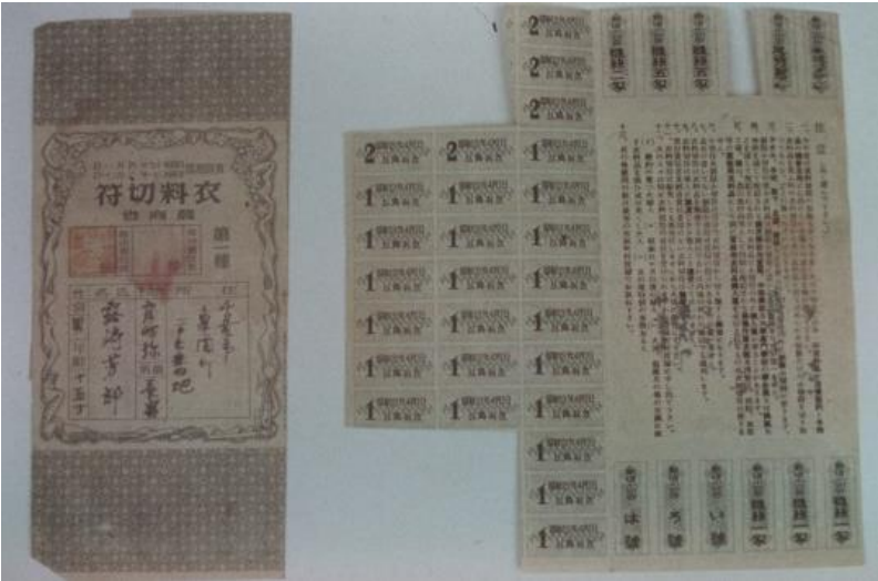
商工省・農商省の衣料切符 Clothing ration cards from the Ministry of Commerce and Industry and the Ministry of Agriculture and Commerce (昭和17年には衣料品から副食品まで生活必需品は切符配給制になった。) (In 1942, daily necessities, from clothing to side dishes, were distributed using a ration-card system.)