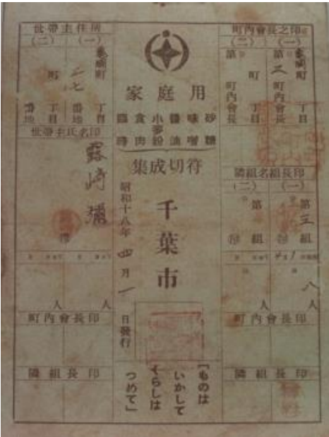
家庭用砂糖等集成切符 Integrated ration card to exchange for sugar and other household items